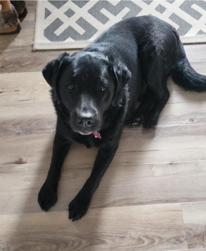
Weight: 55 lbs