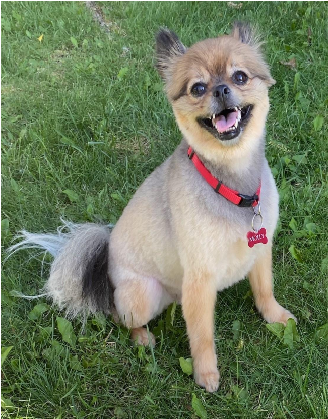
Weight: 11 lbs